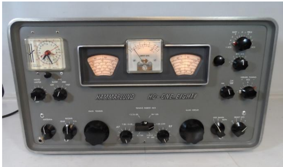
Hammarlund HQ-180C General Coverage Shortwave Receiver Looking brand new today – but built in 1959, over 60 years ago

So, the general thinking amongst the ham radio operators, short wave listeners, and general radio aficionados is that such radios – be they receiver, transmitter, transceiver, accessory, or whatever – is the gem of the century when found. Their vision is of a prized vintage radio emitting golden tones of CW, AM and SSB from Ham Radio and Shortwave Broadcast stations while shining like a new penny with spotless paint, bright and clear vacuum tubes, and a nicely plated chassis. Maybe like this gem acquired from Nationwide Radio 1 , a few months ago . . .