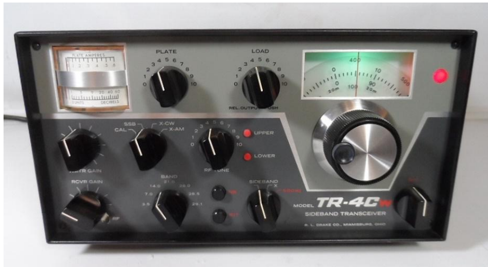
Drake TR-4Cw/RIT HF Transceiver Cannot anywhere be distinguished from brand new

Now for another example of this technique . . .